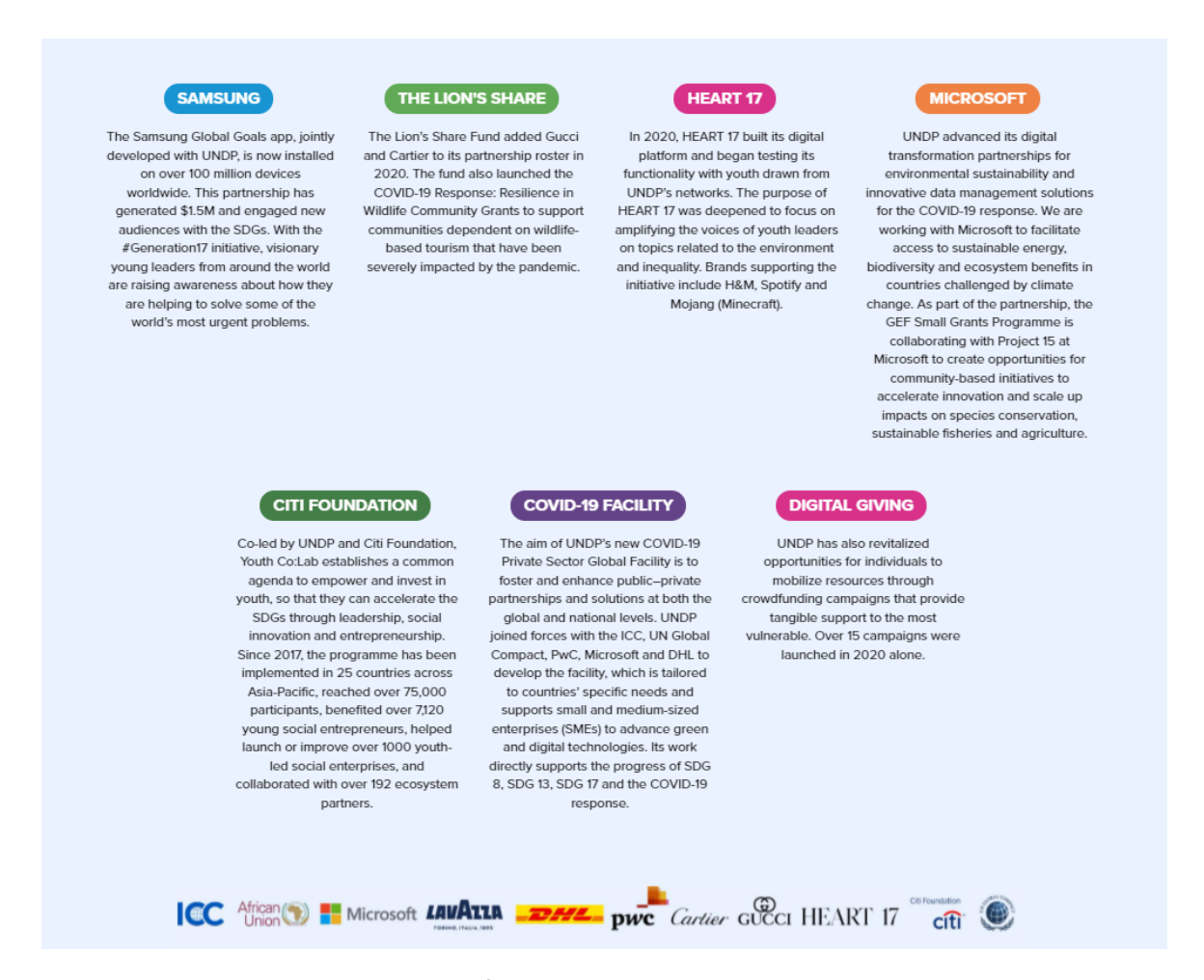
Figure 1.2 UNDP private sector initiatives featured in the 2020 UNDP Annual Report

The Report also highlights UNDP's COVID-19 Private Sector Global Facility, the aim of which is "to foster and enhance public—private partnerships and solutions at both the global and national levels."