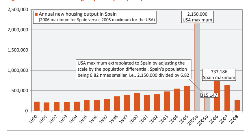
Figure 1: Annual new housing output in Spain (2005)

some countries' public debt and in the viability of government action to stabilise their economies has strengthened the position of those advocating for neoliberal economic solutions: cut public expenditure, raise taxes, deregulate key sectors, and privatise public enterprises and services to achieve budget stability. Spain has been particularly affected.